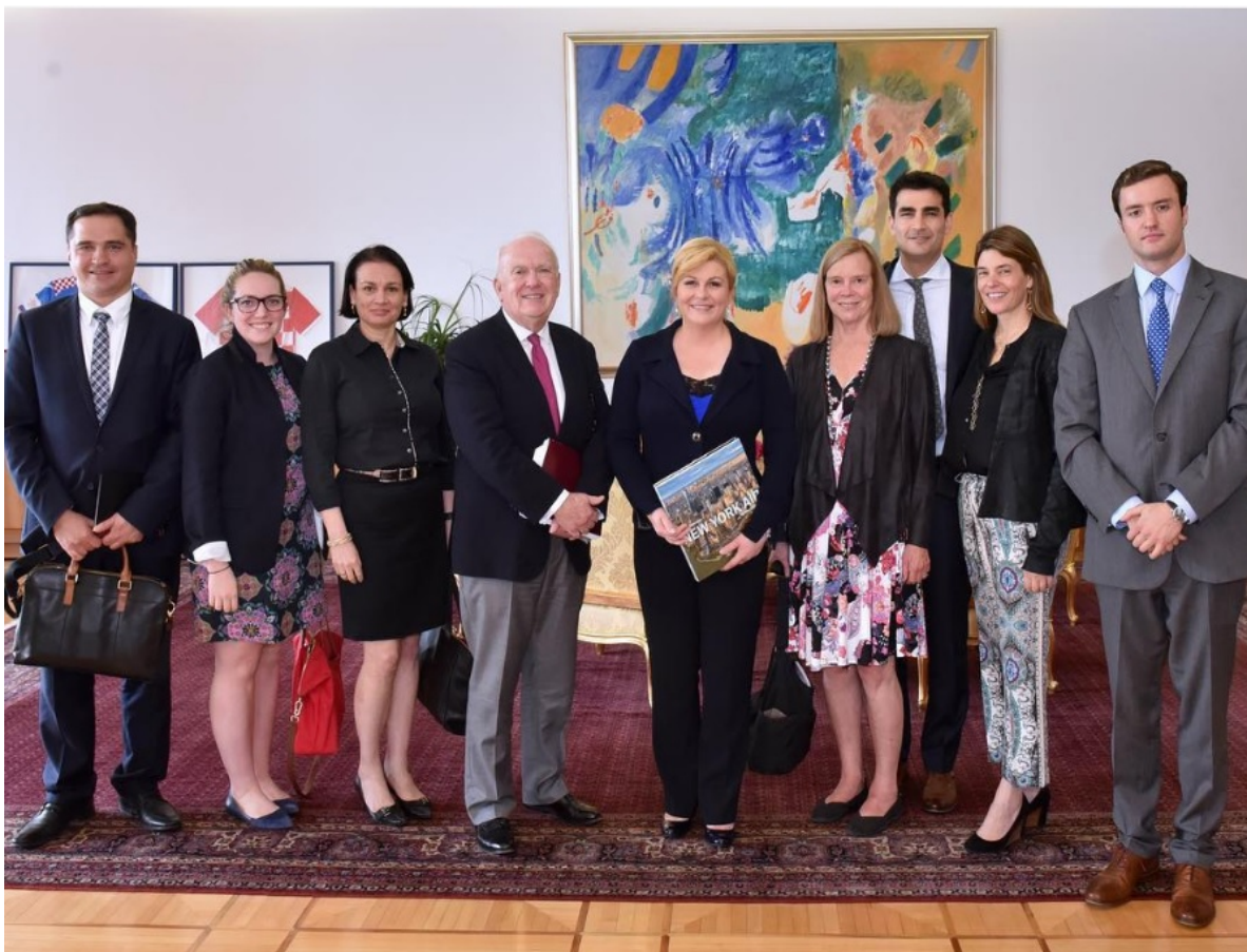
Network 20/20 delegates meet with Kolinda Grabar-Kitarović, President of the Republic of Croatia

At the close of the fiscal year, the delegates were compiling their notes in preparation for the publication of a report on the group's findings.